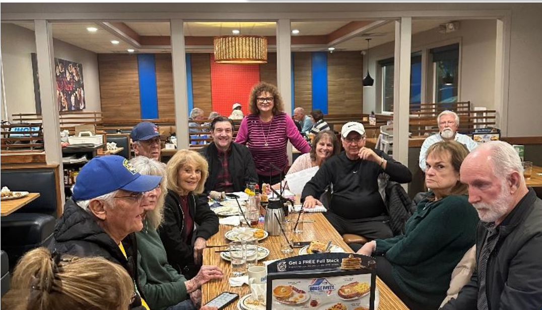
Our all important Car show meetings