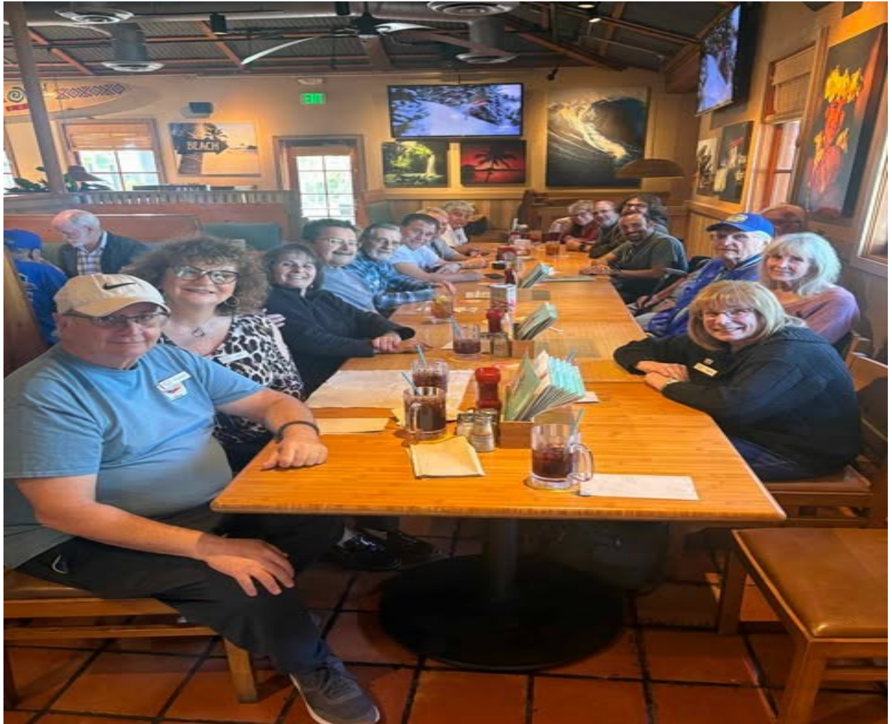
Lunch post club meeting at Islands