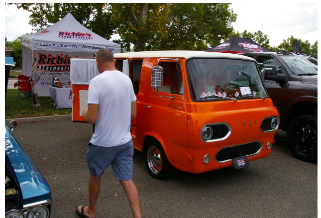
CHARLIE'S VAN ON DISPLAY