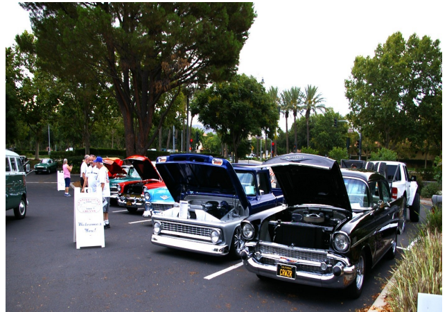
CLUB CARS AT THE SIMI PD